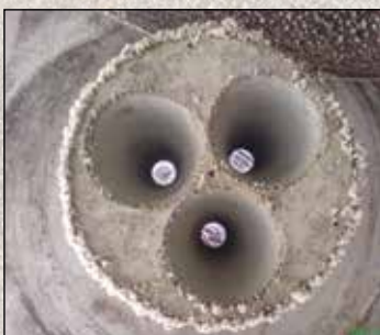
Exterior of the sensor is coated with dust, while self-cleaning properties keep the transducers clean and functional.