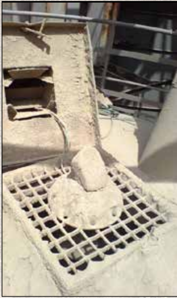
Fully operational sensor on cement silo despite aggressive dust.