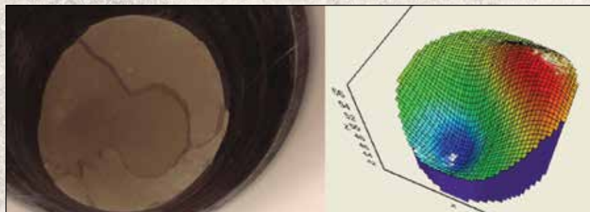
Detects irregular topography and reflects it in the 3D image.

No air purge needed for self-cleaning transducers that resist dusty buildup.